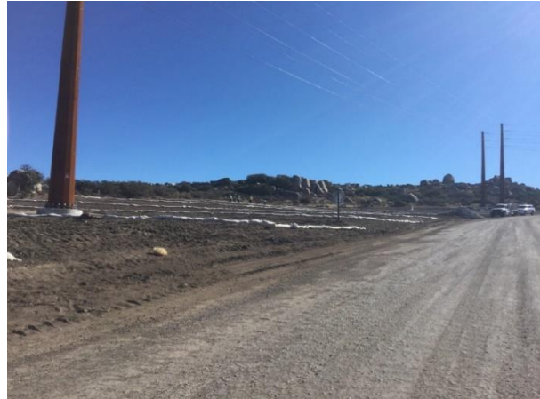
Photo 2: ECMs observed crews conducting restoration work by hand near collection tower 40. This activity was monitored full time by a biologist in accordance with MM BIO-1c.