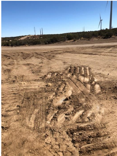
Photo 3: Location of stained soil at laydown yard #6 that was reported on Wednesday, 12/27/2017. The above photo shows laydown yard #6 after the stained soil had been cleaned in accordance with the Spill Prevention, Control and Countermeasure Plan.