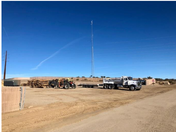
Photo 1: ECMs observed site and equipment demobilization at laydown yard #6.